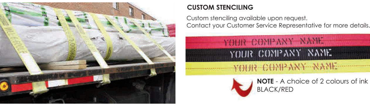
ALL STRAP ASSEMBLIES OR SYSTEMS ARE AS STRONG AS THEIR WEAKEST COMPONENT INCLUDING THE POINT OF ATTACHMENT.